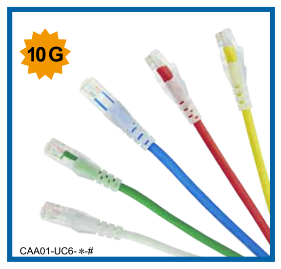
CAT 6 UTP PATCH CABLE (CAA01-UC6-*-#)

PATCH CORD, CAT6, UTP, RJ45, molded boot, available in different length and color. S/N:C04-008